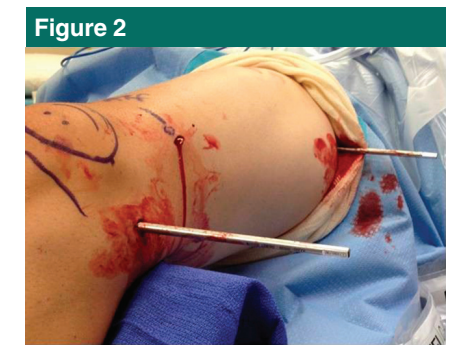
Intraoperative photograph of a thigh demonstrating the placement of half pins distal and proximal to the proposed osteotomy site. The incision for the percutaneous osteotomy is visible on the distal anterolateral thigh.

distal to allow the IM lengthening nail to control the distal fragment (Figure 1, C). The magnitude of deformity and the necessary translation were transferred into an anatomic axis planning model (Figure 1, D). The planned lengthening was an average of 3 cm, which would have a minimal effect on the mechanical axis. Thus, special consideration was not given to correcting this expected mild valgus deformity. For patients who require a lengthening >3 cm, the surgeon must consider the effect that lengthening along the anatomic axis can have on the mechanical axis.